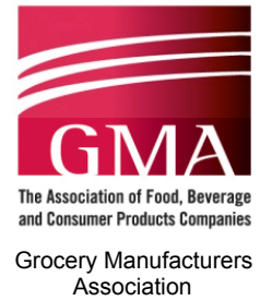
Grocery Manufacturers Association