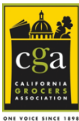
California Grocers Association