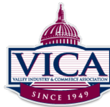
Valley Industry & Commerce Association