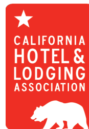
California Hotel & Lodging Association