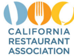
California Restaurant Association