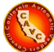
California Automatic Vendors Council