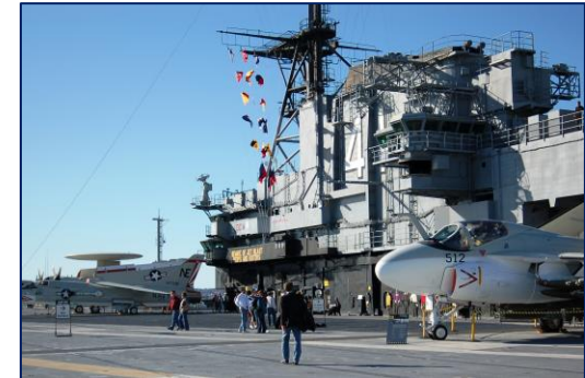
Flight Deck after restoration