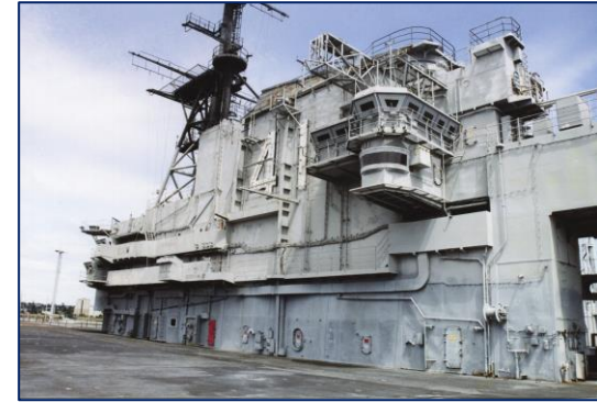
Flight Deck before restoration