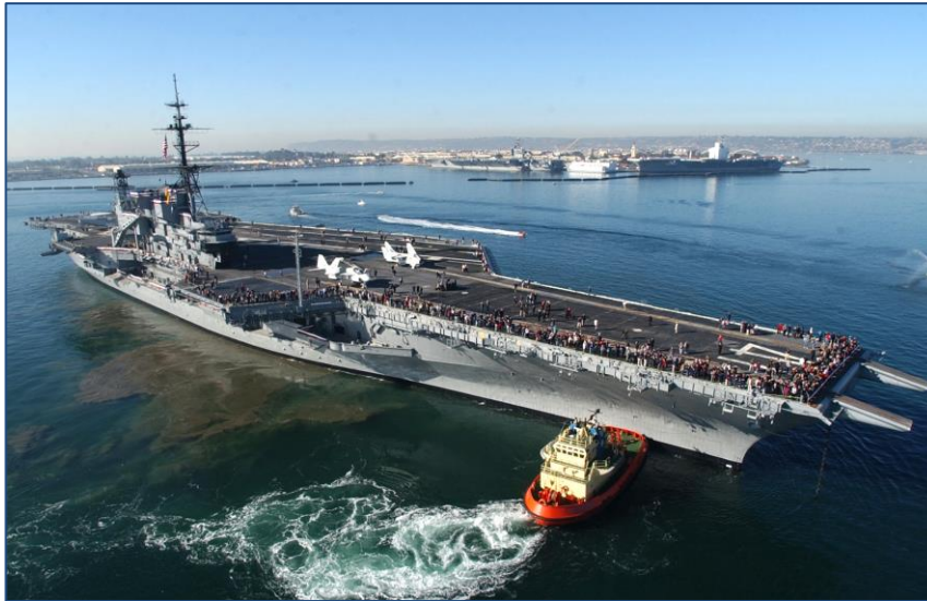
Cross-bay transit to Navy Pier – 2004